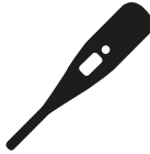
Fever or elevated temperature